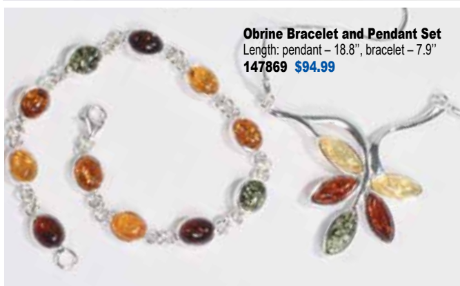
Obrine Bracelet and Pendant Set Length: pendant – 18.8", bracelet – 7.9" 147869 $94.99