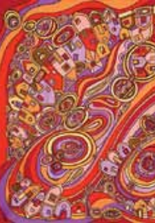
Sun City (red) 101458