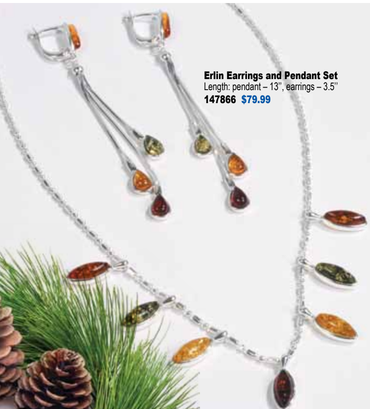
Erin Earrings and Pendant Set Length: pendant – 13", earrings – 3.5" 147866 $79.99