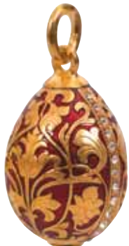
Golden Stitches 122060