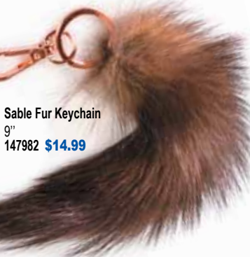
Sable Fur Keychain 9" 147982 $14.99