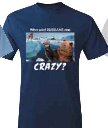
Crazy Russian $12.99