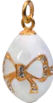
Golden Bow (white) 122054