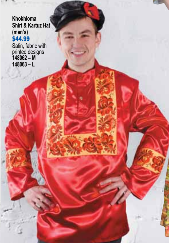
Khokhloma Shirt & Kartuz Hat (men's) $44.99 Satin, fabric with printed designs 148062 – M 148063 – L