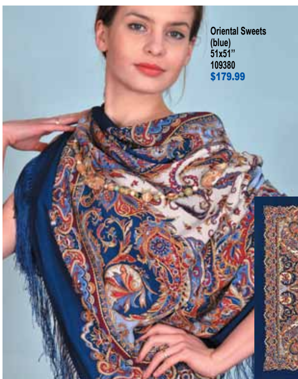
Oriental Sweets (blue) 51x51" 109380 $179.99