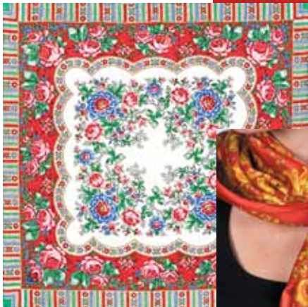
Alyonushka 100% wool 35x35" 104246 $49.99 $35.00