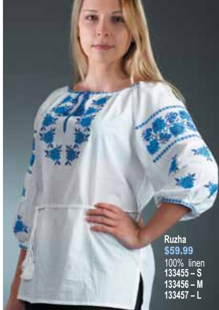
Ruzha $59.99 100% linen 133455 - S 133456 - M 133457 - L