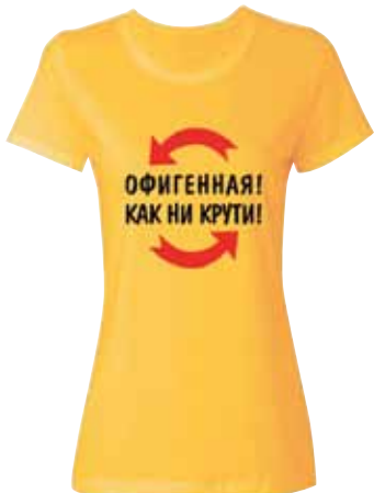
I'm awesome! Like it or not! $12.99