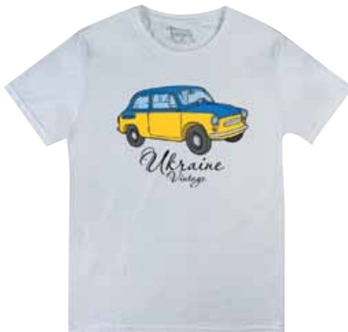
Ukraine Vintage $15.99

For women For men 148025 - S 148021 - S 148026 - M 148022 - M 148027 - L 148023 - L