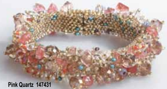
Pink Quartz 147431