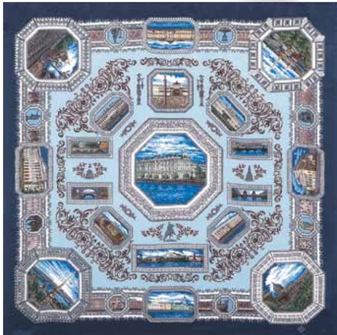
Saint Petersburg 100% silk 35x35" 94652 $56.99