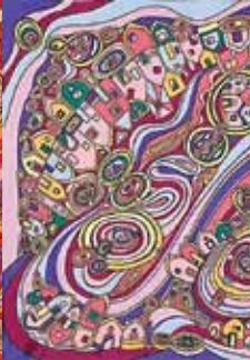
Sun City (lavender) 101457