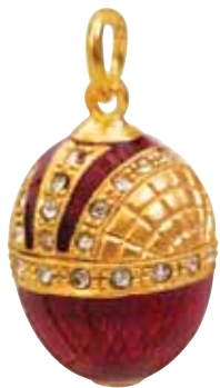
Imperial Crown 122062