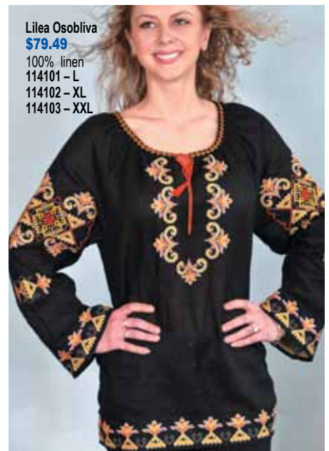
Lilea Osobliva $79.49 100% linen 114101 - L 114102 - XL 114103 - XXL