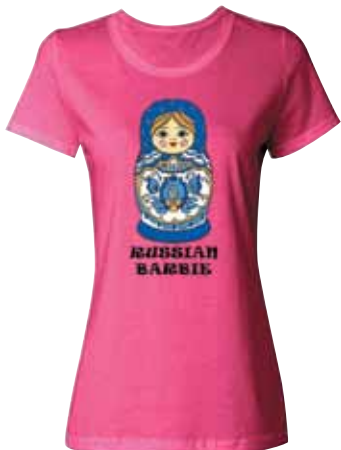
Russian Barbie $12.99