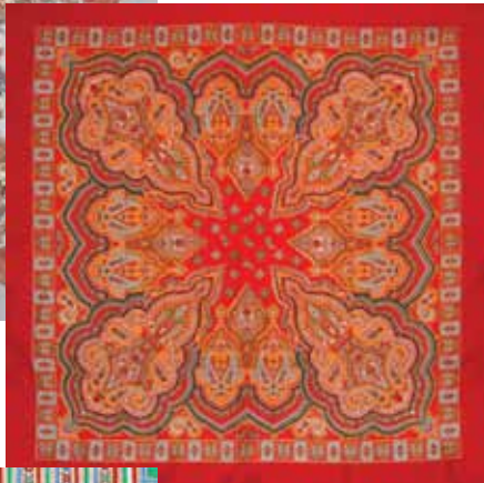
Sparklet 100% wool 35x35" 104248 $49.99 $35.00