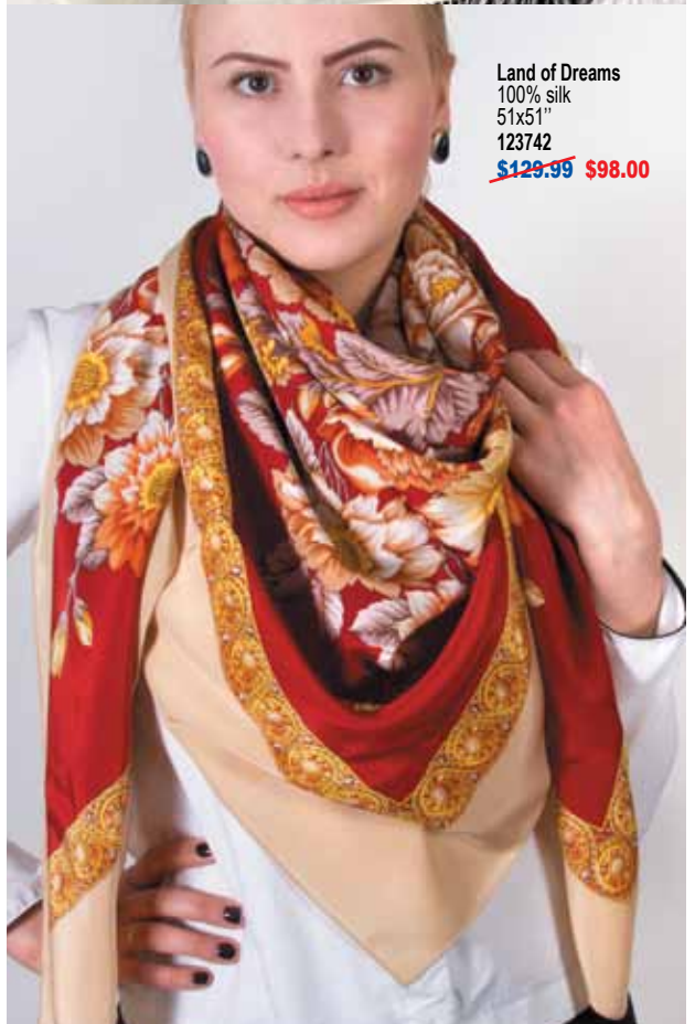
Land of Dreams 100% silk 51x51" 123742 $129.99 $98.00