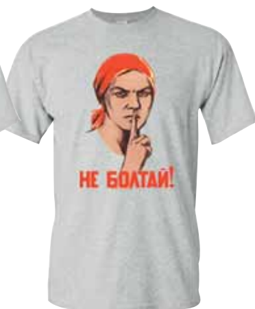
Don't Talk $12.99

148221 - S 148223 - L 148222 - M 148224 - XL