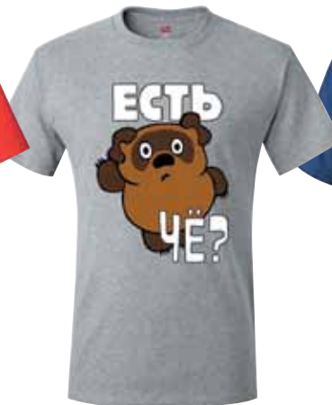
Got Any? $12.99