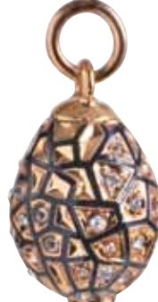
Pine Cone 148219