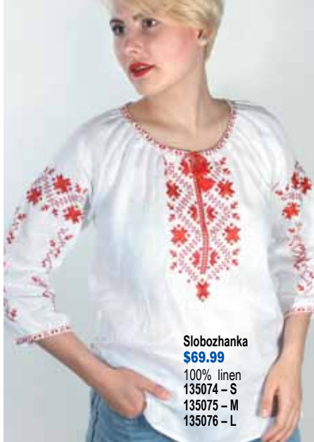
Slobozhanka $69.99 100% linen 135074 - S 135075 - M 135076 - L