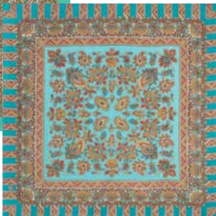
Sunbeam 100% wool 28.3x28.3" 127909 $39.99 $30.00