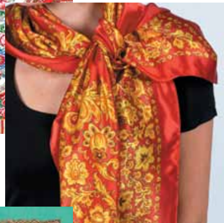
Patterns of Khokhloma 100% silk 35x35" 113949 $49.99 $45.00