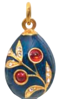
Sour Cherry 122071