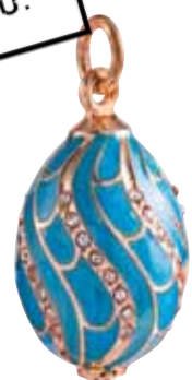
Spring Bud 148211