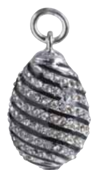
Curls 148214 $36.99