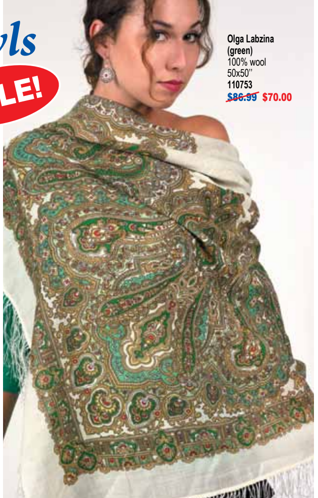
Olga Labzina (green) 100% wool 50x50" 110753 $86.99 $70.00