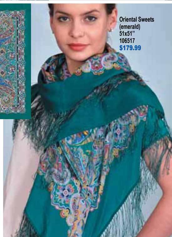
Oriental Sweets (emerald) 51x51" 106517 $179.99