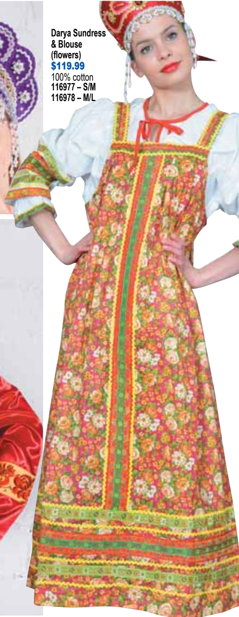
Darya Sundress & Blouse (flowers) $119.99 100% cotton 116977 – S/M 116978 – M/L