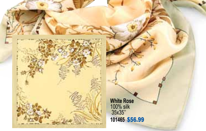
White Rose 100% silk 35x35" 101465 $56.99