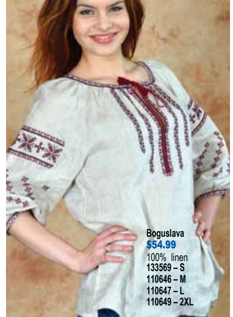
Boguslava $54.99 100% linen 133569 - S 110646 - M 110647 - L 110649 - 2XL