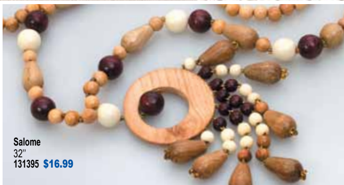
Salome 32" 131395 $16.99

The various colors correspond to different wood species: brown – oak; red – plum, cherry; pale-yellow – apricot; white and gray – hornbeam; green – ash.