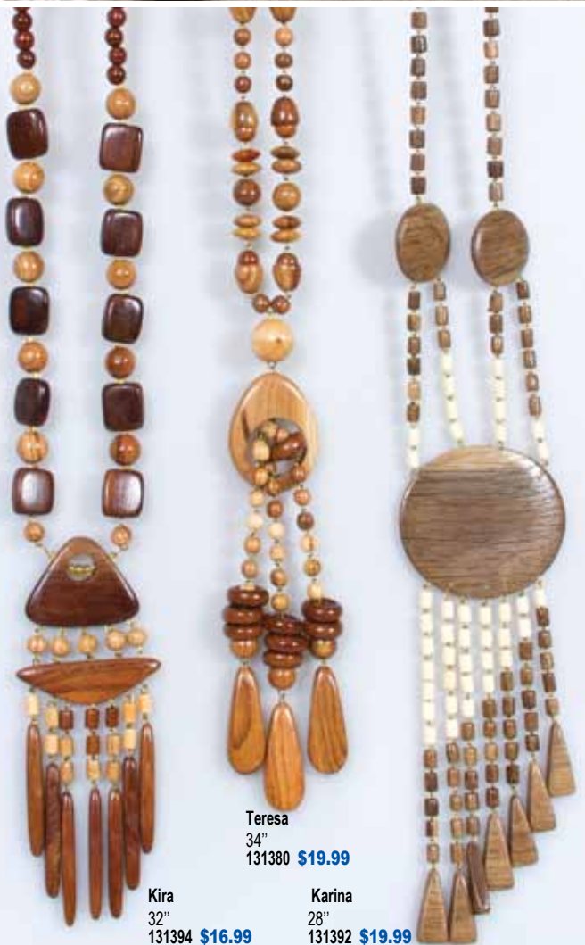
Teresa 34" 131380 $19.99