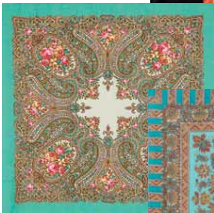
Cinderella 100% wool 35x35" 127903 $49.99 $35.00