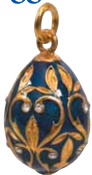
Starry Night 121785