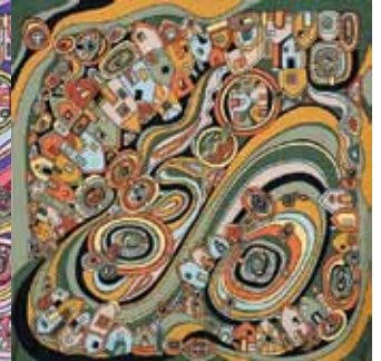
Sun City (green) 94650