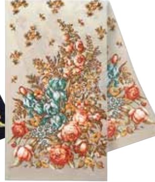
Tender touch (beige) 112496