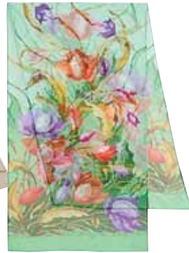
Clear ponds 101469