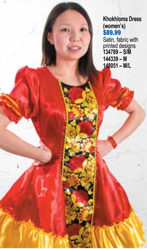
Khokhloma Dress (women's) $89.99 Satin, fabric with printed designs 134789 – S/M 144339 – M 148051 – M/L