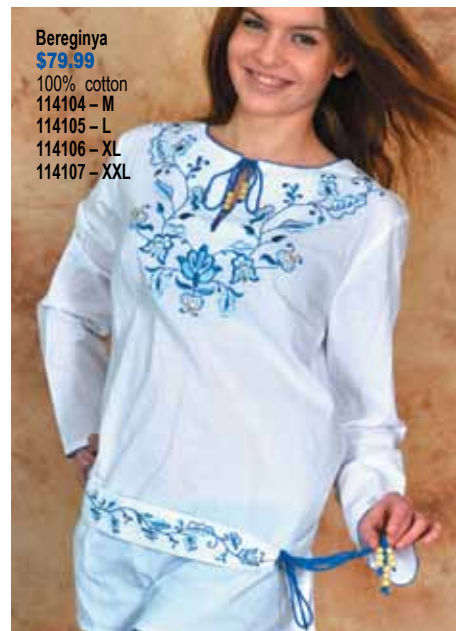
Bereginya $79.99 100% cotton 114104 - M 114105 - L 114106 - XL 114107 - XXL