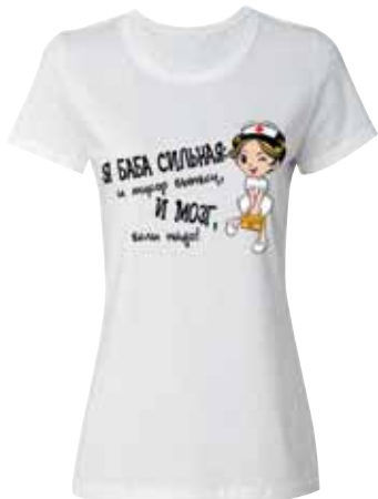
I'm a Strong Chick... $12.99