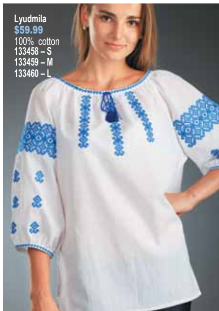
Lyudmila $59.99 100% cotton 133458 - S 133459 - M 133460 - L