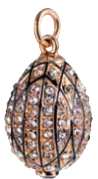
Royal 148217 $36.99