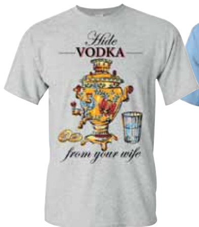
Hide Vodka $12.99