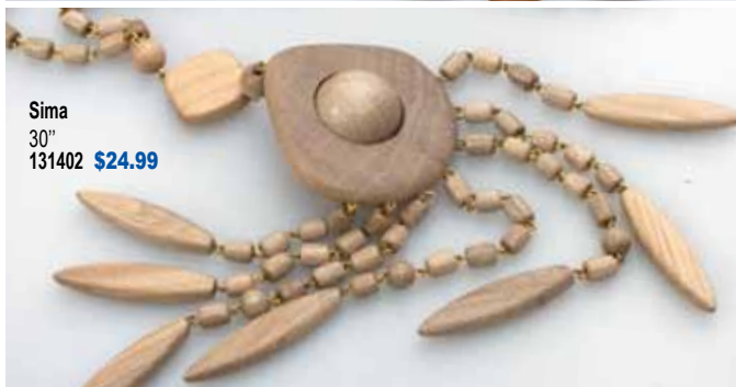
Sima 30" 131402 $24.99