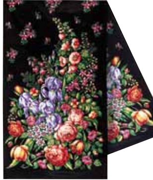
Tender touch (black) 112497

PAVLOVO POSAD SHAWLS 100% silk 35x35" $49.99