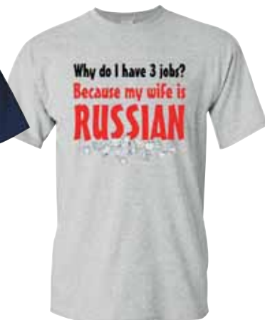
Russian Wife $12.99