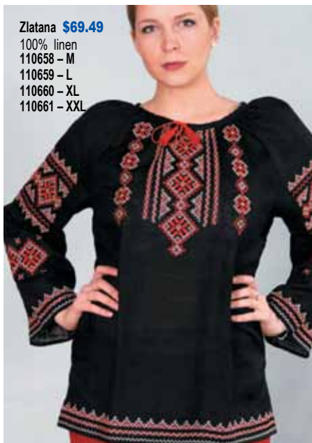
Zlatana $69.49 100% linen 110658 - M 110659 - L 110660 - XL 110661 - XXL