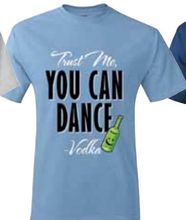
You Can Dance $12.99