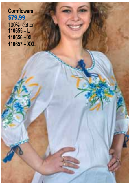
Cornflowers $79.99 100% cotton 110655 - L 110656 - XL 110657 - XXL