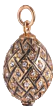
Elegance 148218 $36.99