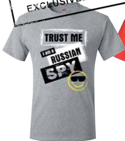
Russian SPY $12.99