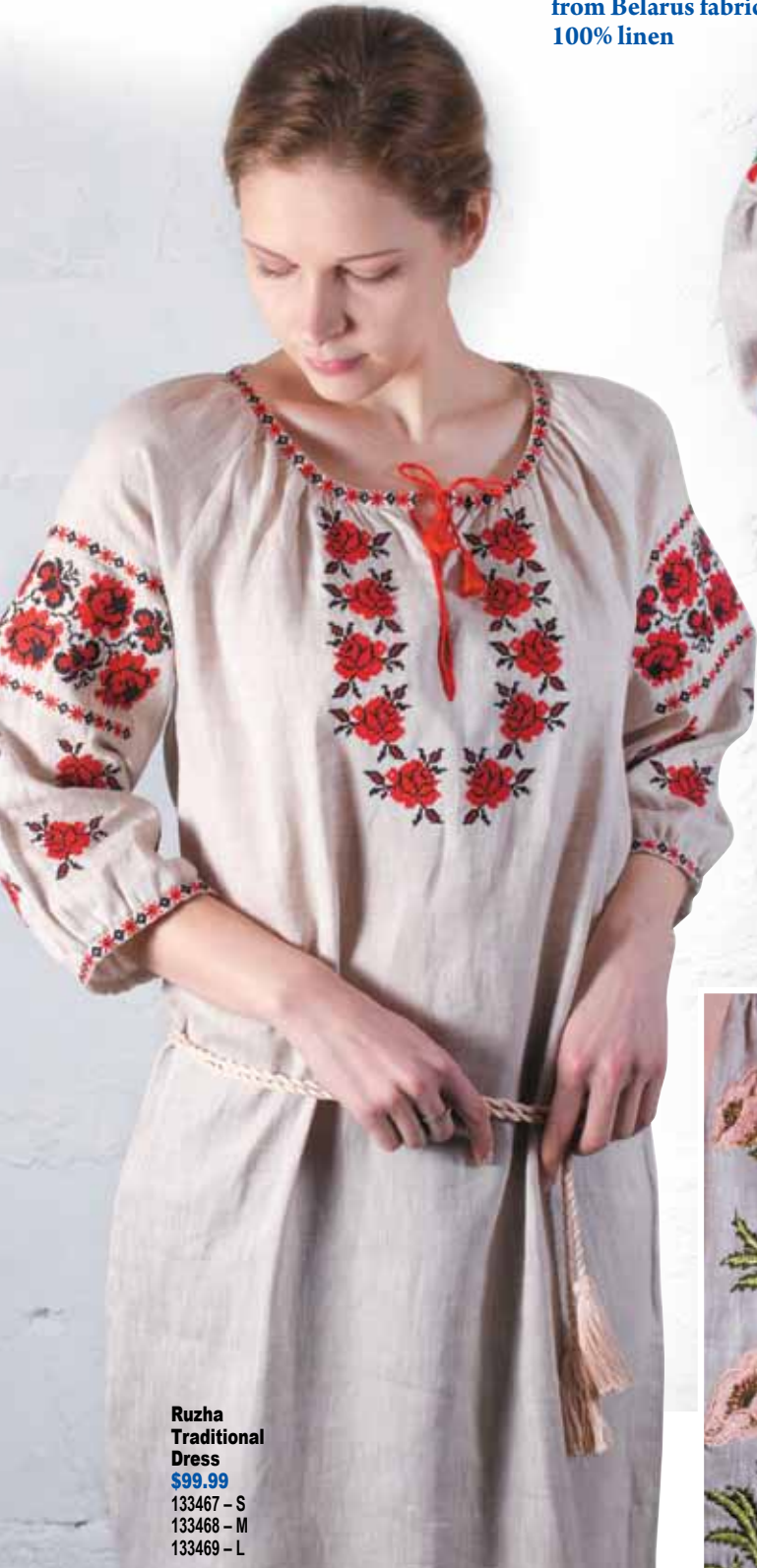
Ruzha Traditional Dress $99.99 133467 - S 133468 - M 133469 - L

Made in Russia & Ukraine from Belarus fabric. 100% linen