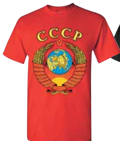
USSR Coat of Arms $12.99