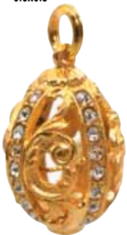
Golden Lace 122070