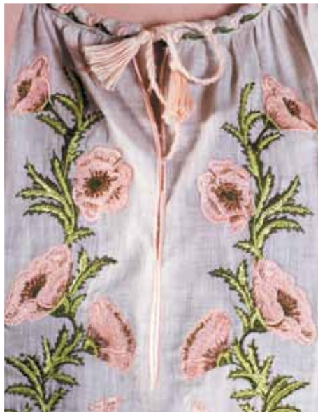
Poppies Traditional Dress (pink embroidery) Limited Edition (exp availability: mid-June) Size: S 133464 $99.99