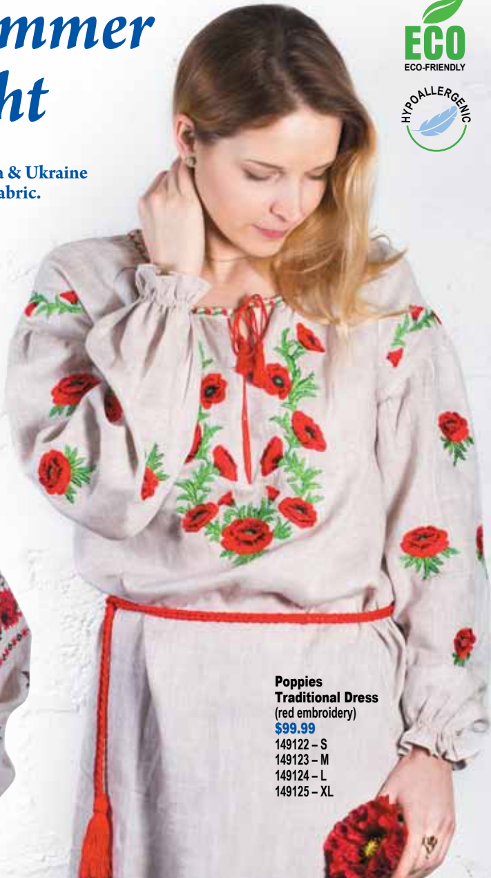
Poppies Traditional Dress (red embroidery) $99.99 149122 - S 149123 - M 149124 - L 149125 - XL