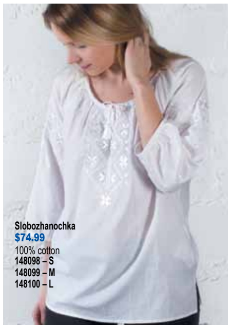
Slobozhanochka $74.99 100% cotton 148098 - S 148099 - M 148100 - L