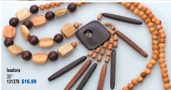
Isadora 30" 131378 $16.99