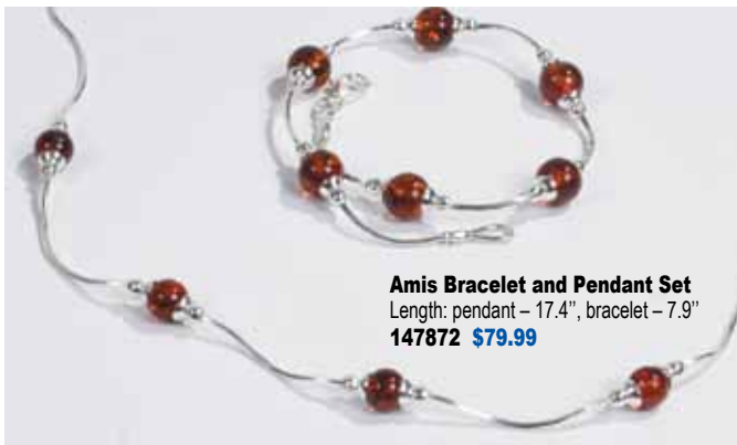
Amis Bracelet and Pendant Set Length: pendant – 17.4", bracelet – 7.9" 147872 $79.99