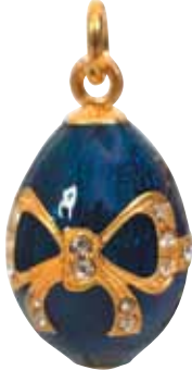
Golden Bow (blue) 122057