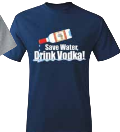
Drink Vodka $12.99