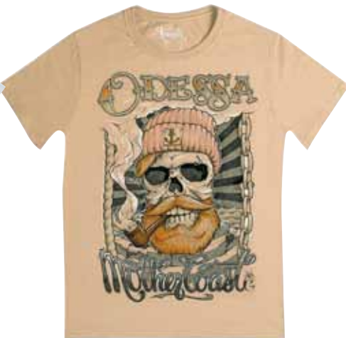
Odessa Mother Coast $19.99

For women For men 148025 - S 148021 - S 148026 - M 148022 - M 148027 - L 148023 - L