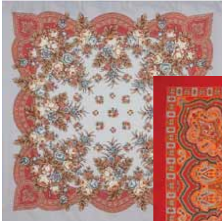
In the Garden 100% wool 50x50" 129176 $79.99 $60.00